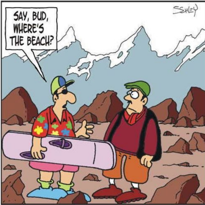
Billy-Joe was great on sport but lousy on geography.

Bellwork: List 3 careers that require geography skills.